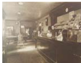
LATE 1800'S TO EARLY 1900'S