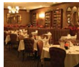
LAKE ELMO INN - PRESENT