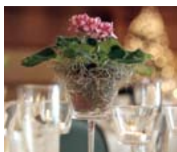
LAKE ELMO INN EVENT CENTER - SINCE 2006